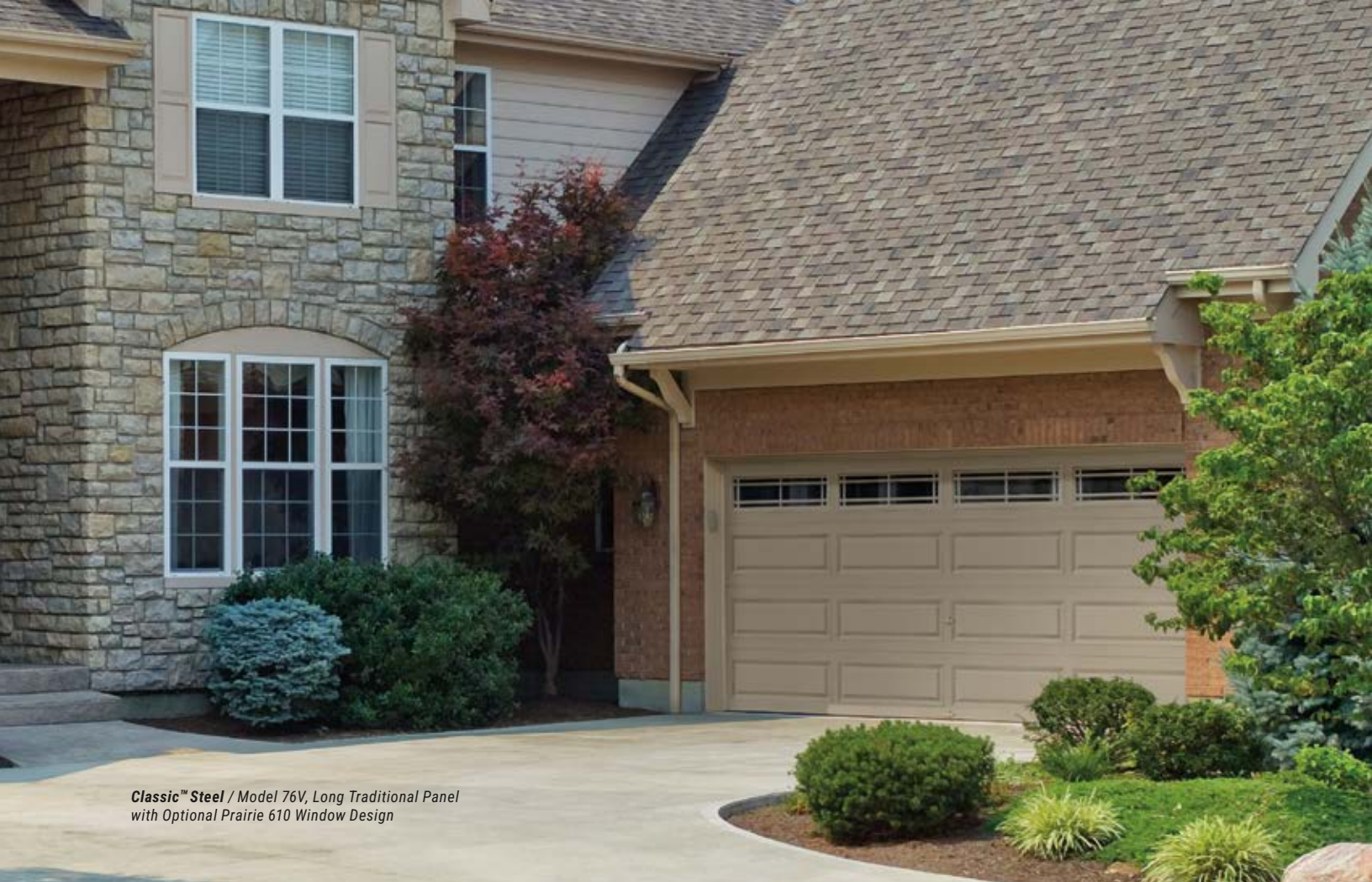
Classic™ Steel / Model 76V, Long Traditional Panel with Optional Prairie 610 Window Design