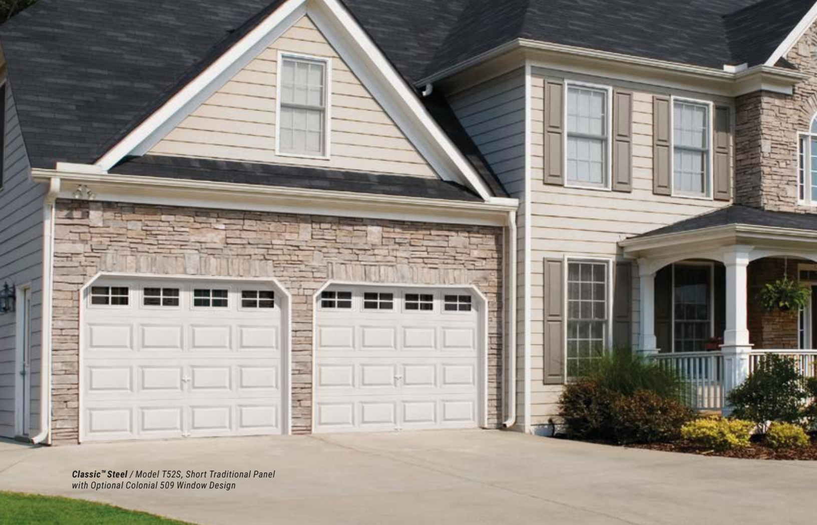
Classic™ Steel / Model T52S, Short Traditional Panel with Optional Colonial 509 Window Design