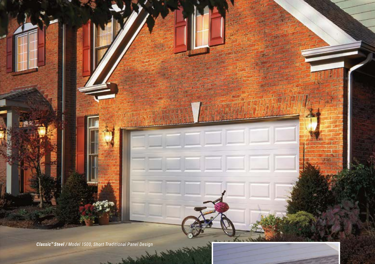
Classic™ Steel / Model 1500, Short Traditional Panel Design