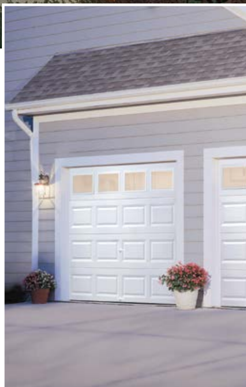
Classic™ Steel / Model T42S, Short Traditional Panel with Plain Short Windows